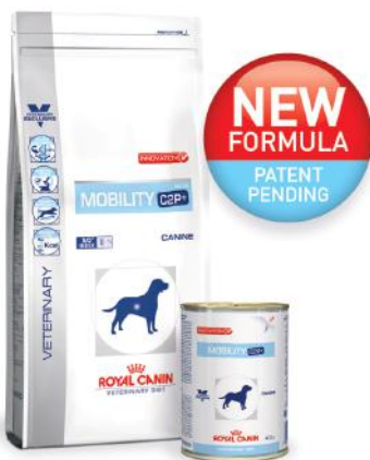
Mobility C2P+ 2kg; 7kg; 14kg

As well as delivering great palatability, Royal Canin Mobility C2P+ is also available in 2kg, 7kg and 14kg packs of dry food and in a 400g can of 'loaf' wet food, offering a choice of textures to suit every individual dog's preference.